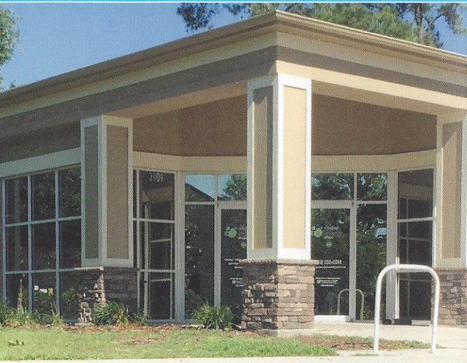
Photo: Our 39th Ave/I-75 Location in Gainesville, FL.

Veterinary technicians perform valuable medical and non-medical services in our clinical practice. They are graduates of an AVMA CVTEA-accredited veterinary technology program and usually have an Associates or Baccalaureate degree. The veterinary technician is educated and trained to support our veterinarians by assisting with surgery, laboratory procedures, radiography, anesthesiology, treatment and nursing, and client education. Often, veterinary technicians pursue specialties in emergency and critical care, anesthesiology, internal medicine, animal behavior, or dentistry. Personal attributes that contribute to the success of a Vet Tech include a strong science background, an ability to work well with people and animals, and excellent communication and decision-making skills.